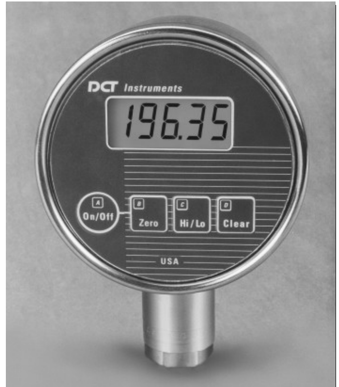
The DCT Series PI Digital Gauges have the following complete Factory Mutual Approved Classifications:

Units of measure are field-selectable and the unit is offered with gage, absolute, vacuum, or compound reference.